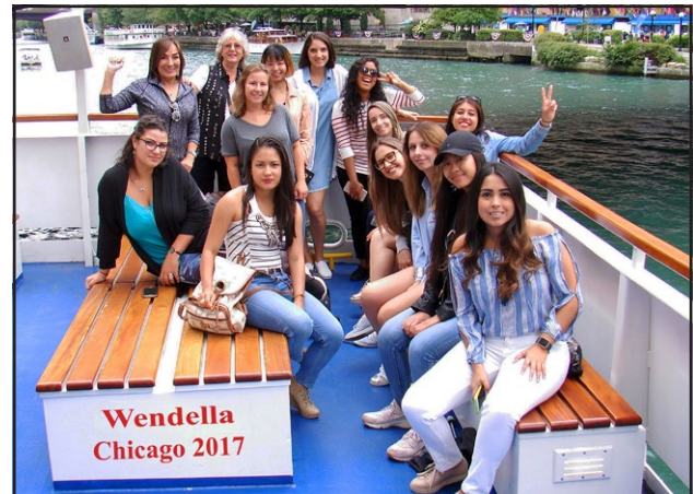
Our Chicago au pairs, community counselor and area coordinator enjoyed a boat tour on Chicago River and Lake Michigan. How nice to experience the city from a boat!