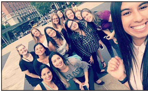
Hello from our July arriving au pairs! They enjoyed the EurAupair workshop as well as New York City.