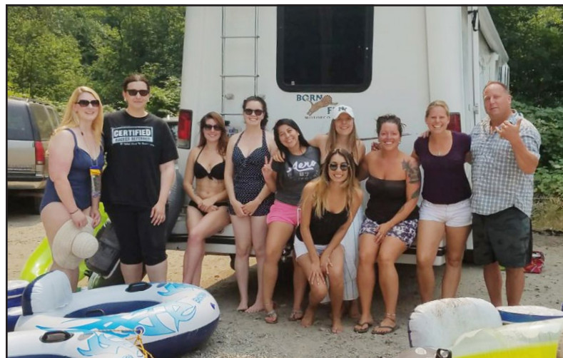
The group is getting ready for their adventure.